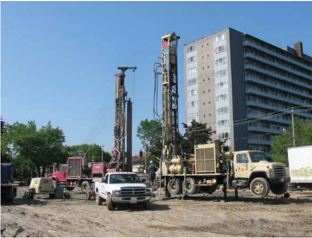
Drilling for the geothermal pipefield

In 2007, Artscape issued a request for qualifications to find a firm that could create a unified way-finding system for the Artscape Wychwood Barns project. Gottschalk + Ash International won the competition with its simple and intuitive designs.