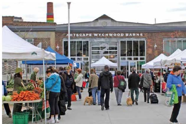
The Stop's Farmer's Market at Artscape Wychwood Barns