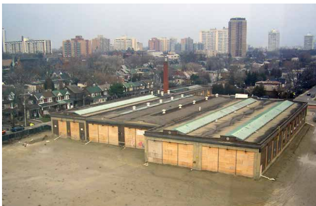
Overhead view of the site pre-construction

The vision for the project was developed by a five-member Community Advisory Council created in 2001 by Artscape. The group's mandate was to act as stewards of the consultation process, provide guidance on issues ranging from design to tenant selection and make ongoing recommendations. The Community Advisory Council, along