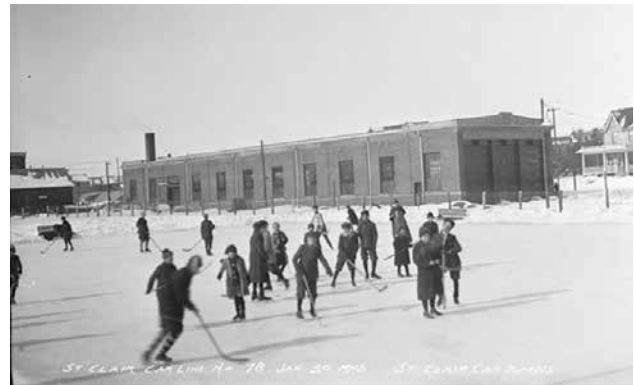
Archive photo of the skating rink outside the streetcar barns.