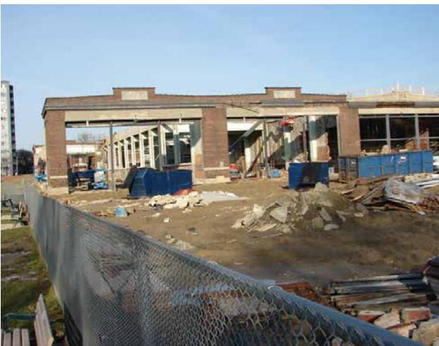
During construction of the Green Barn and Barn 5