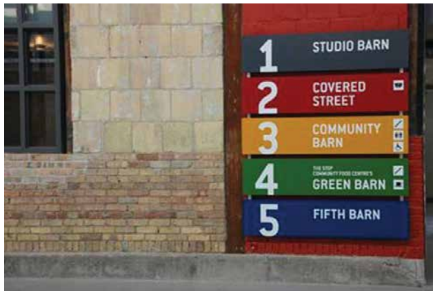
The five barns at Artscape Wychwood Barns

Artscape Wychwood Barns comprises five programmed components: the Studio Barn, the Covered Street Barn, the Community Barn, The Stop Community Food Centre’s Green Barn and the 5th Barn.